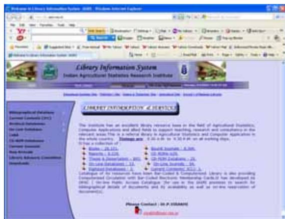
Home page of Library Information System

Library Information System of the Institute is automated, barcoded and partially digitized. The Full text of M.Sc. and Ph.D. Thesis are available online in digital format. Library has its well featured website at http://lib.iasri.res.in which is accessible across the world in all 365 days.