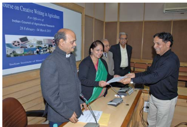
A participant receiving Certificate for Creative Writing in Agriculture at IIMC, New Delhi